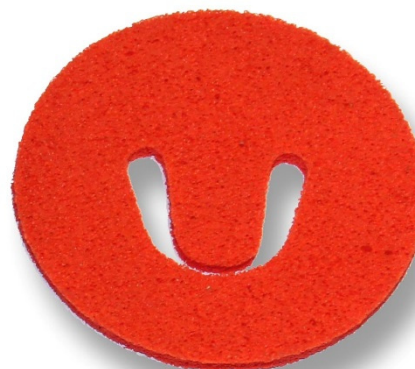
110156 Pre-formed medium upper