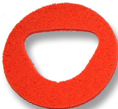
110155 Pre-formed large lower