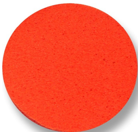
110150 Sponge D.104 x 6 mm