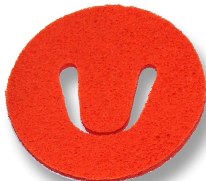
110157 Pre-formed large upper