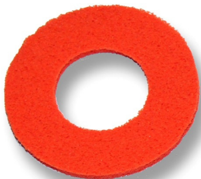
110153 External 104 - hole 53