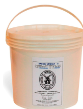
Resin replacement kit